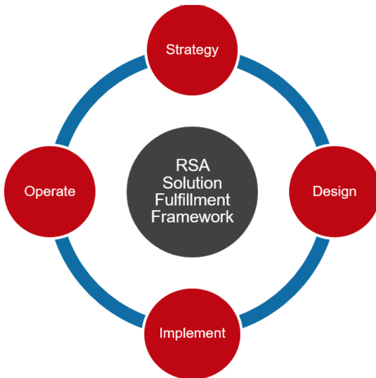
RSA Solution Fulfillment Framework

By combining our industry-leading RSA SecurID Access solution with the capabilities of our Identity Assurance Practice, organizations can embrace the disruptive nature of IT while managing the risks to their business.